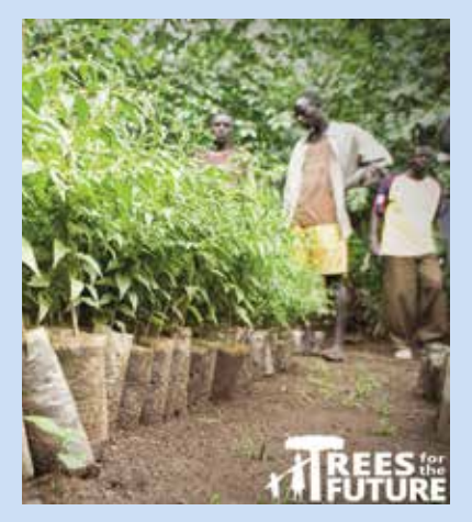
Our goal is to give back to communities and to do our part to replenish national forestry, driving sustainability.

We're also continually exploring new ways to reduce our impact on the planet. The development of resources and practices to make reusable crating feasible