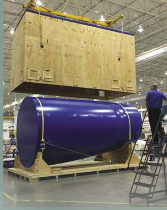
"C&F's experience and expertise has made all the difference to us." Worldwide Aerospace Equipmen Manufacturer

There's nothing more reassuring to a client than seeing a packaging engineer smile, nod their head, and rub their hands together as they enthusiastically circle and assess the "hard to move" object they're about to bring into full submission!