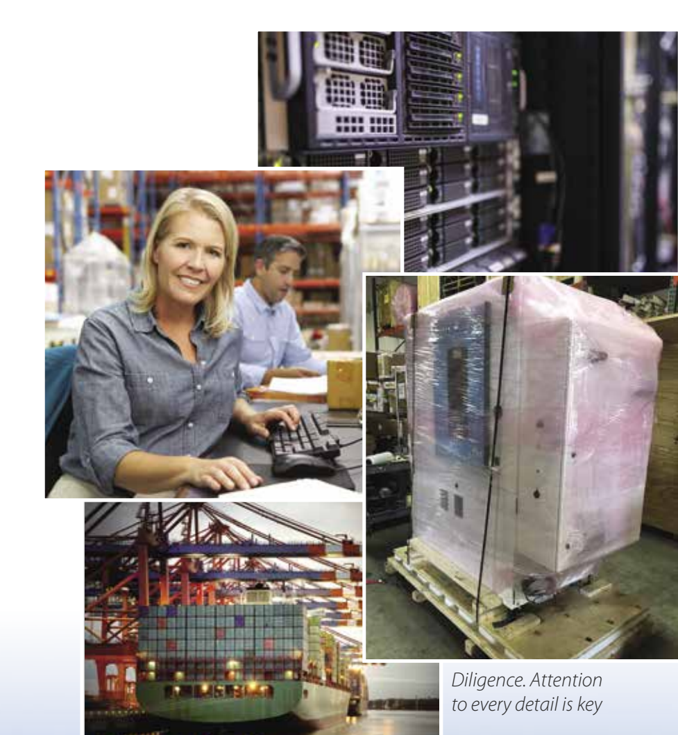
To excel at managing logistics of all kinds is more critical than ever

While our customers benefit from our high standards, they aren't the only ones. Nothing makes our team members happier than rolling up their sleeves, completing a difficult task, and then taking pride in a job well done. We find that you get from people what you expect from people—and we expect the best from ours.