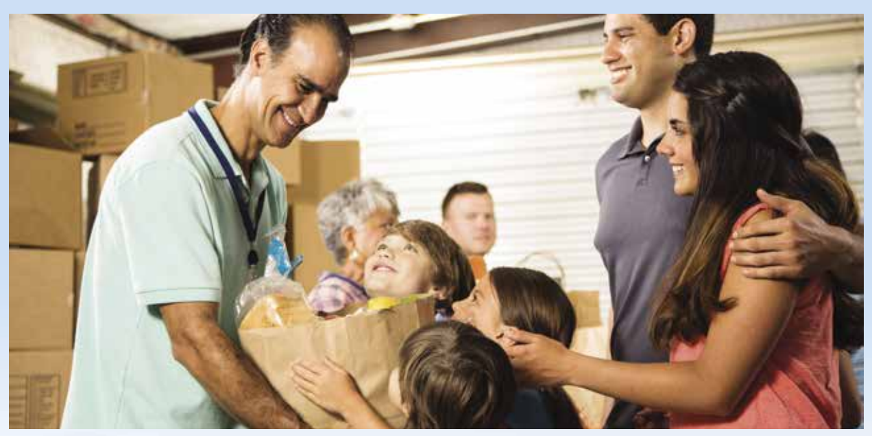
Distributing food and water during and after natural disasters has been a natural response for many C&F locations.

The goal is both to let them know that we (and the world) deeply appreciate what they've done and to encourage others to take an active role in supporting the causes they're passionate about. Similar to our tree-planting initiatives, we've found that Crates for a Cause plants seeds that are blooming into actions that make the world a more beautiful place.